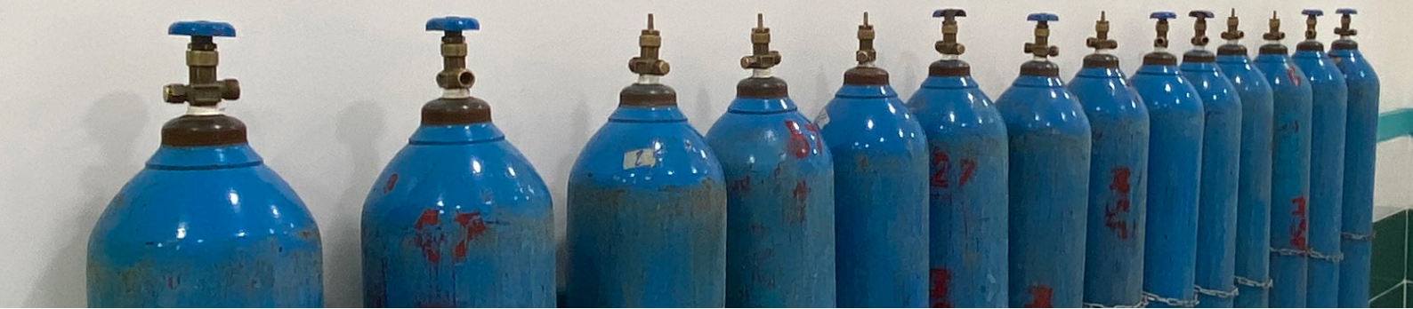
Aden, Yemen