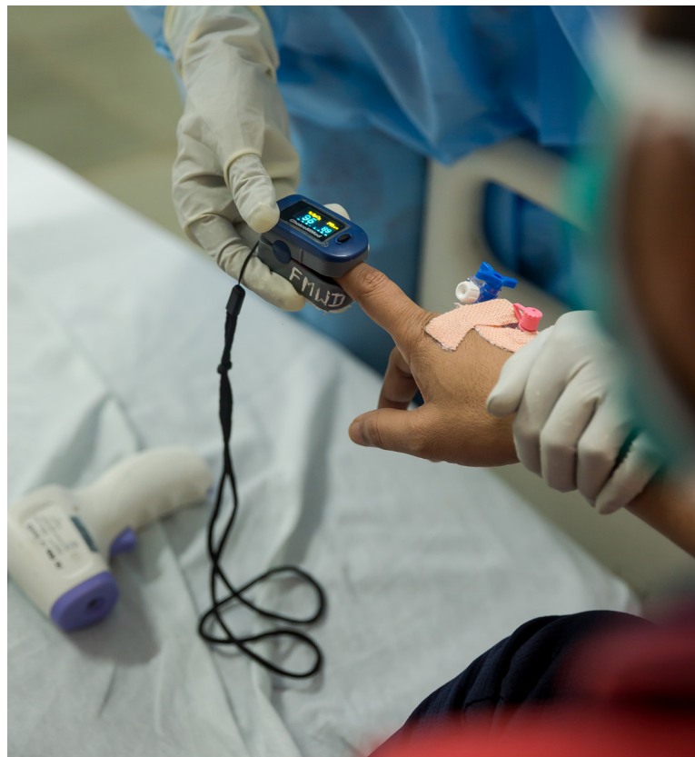
Mumbai, India

(manometers), nasal cannulas and prongs. Measures to increase oxygen supply must also take into consideration the medical materials needed to effectively deliver oxygen to the patient, including oximeters to monitor them and skilled staff to maintain or repair the devices if they break.