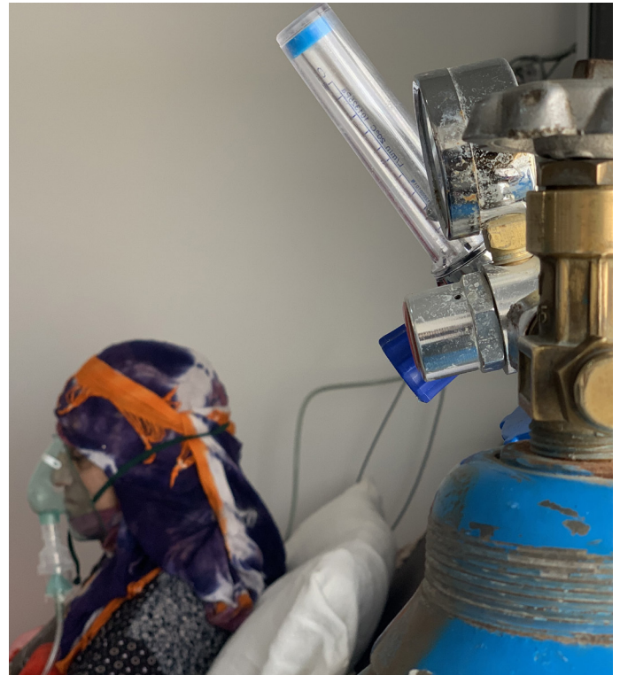
Sana'a, Yemen

The COVID-19 pandemic has exposed pre-existing shortages of medical oxygen, and the inequalities in access to what WHO considers an 'essential medicine'. Not every COVID-19 patient has the same chance of survival, in part based on their ability to access oxygen – the most essential of treatments.