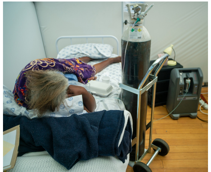
Khayelitsha, South Africa

Health workers in places where MSF encountered shortages in medical oxygen expressed their high levels of distress at having to ration oxygen, which has included deciding who should be prioritised for treatment. Their distress is compounded by the fact that oxygen is an essential medicine.