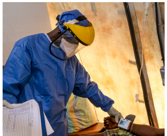
Kinshasa, DRC

The Kinshasa team was able to identify multiple suppliers of oxygen. This was necessary to avoid being dependent of one oxygen plant, which, if it broke down, would have left them without an oxygen source. This was the experience of MSF teams in Brazil, where a private company provided oxygen to multiple states via its three plants in Manaus. When state authorities reported that two of the plants had broken down, supplies were affected across multiple states in the region.