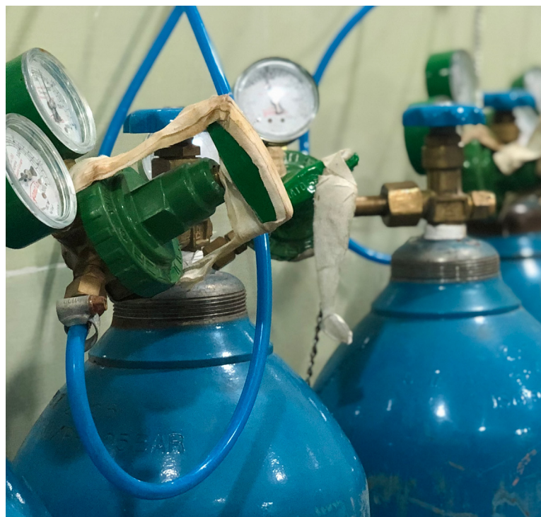
Aden, Yemen

Only one in five people with COVID-19 symptoms suffers respiratory distress sufficient to require oxygen therapy. As COVID-19 patient-care protocols have evolved, medical oxygen is considered essential for the treatment of these patients. They can receive oxygen through normal and high flow oxygen therapies and/or through invasive ventilation. Studies show that early and adequate access to oxygen