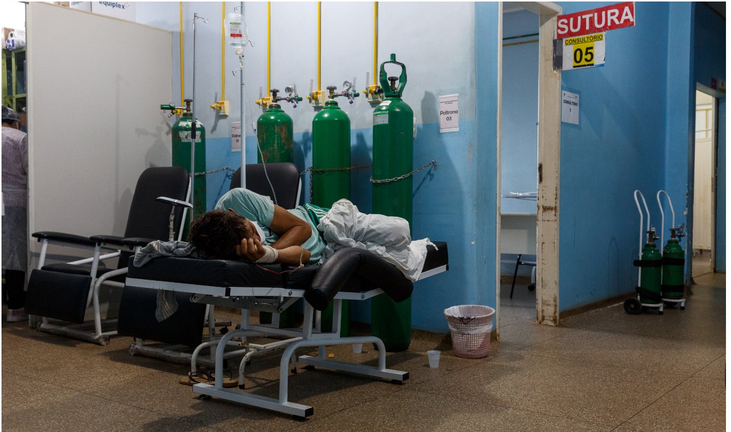
Porto Velho, Brazil - ©Diego Baravelli/MSF