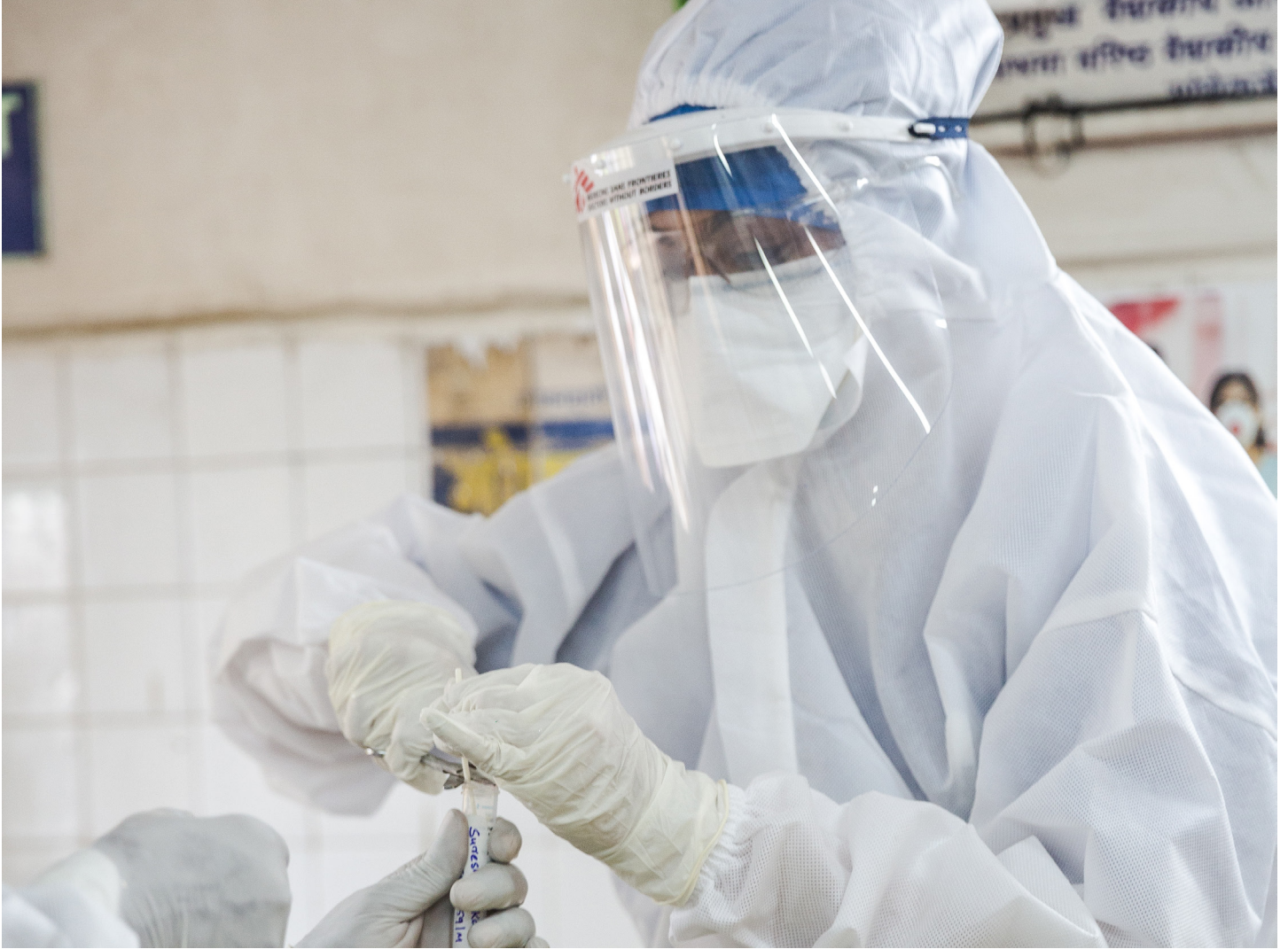
Mumbai, India