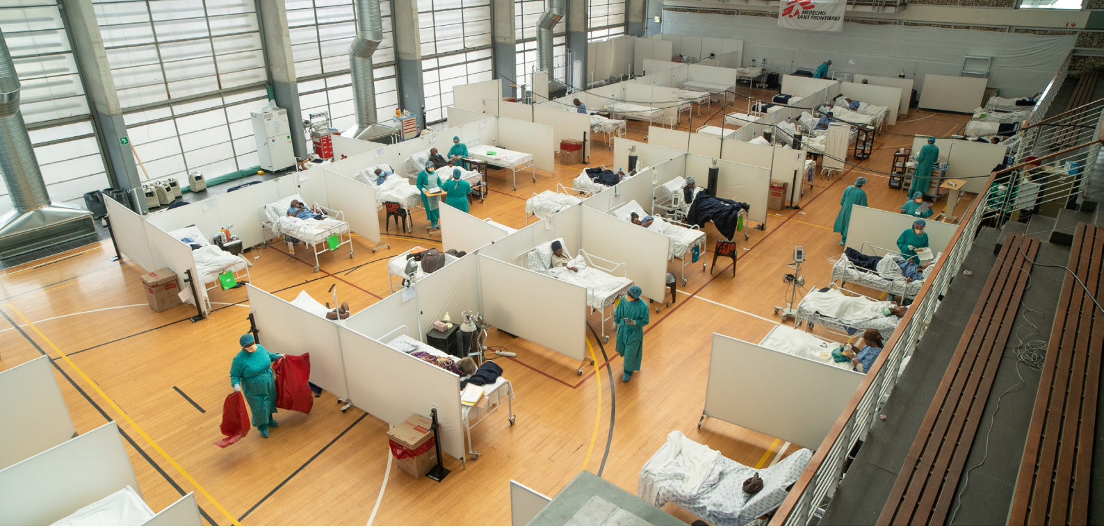
Khayelitsha, South Africa

In Lesotho, the lack of oxygen plants led to similar challenges during the second wave in January 2021. Medical staff were forced to share devices with more than one patient. This limited the amount of oxygen they could provide to each patient and reduced the capacity of medical teams to increase the oxygen flow if necessary.